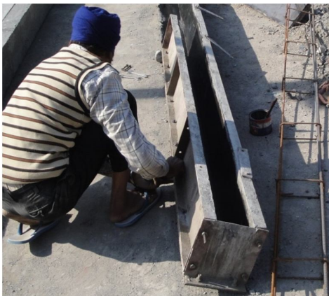
Fig. 1 Beam section and reinforcement details